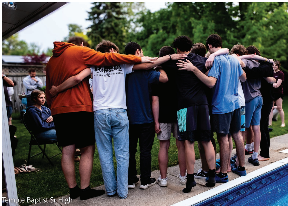
Temple Baptist Sr High